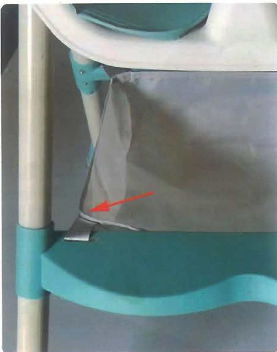
⑦ Buckle up the storage basket