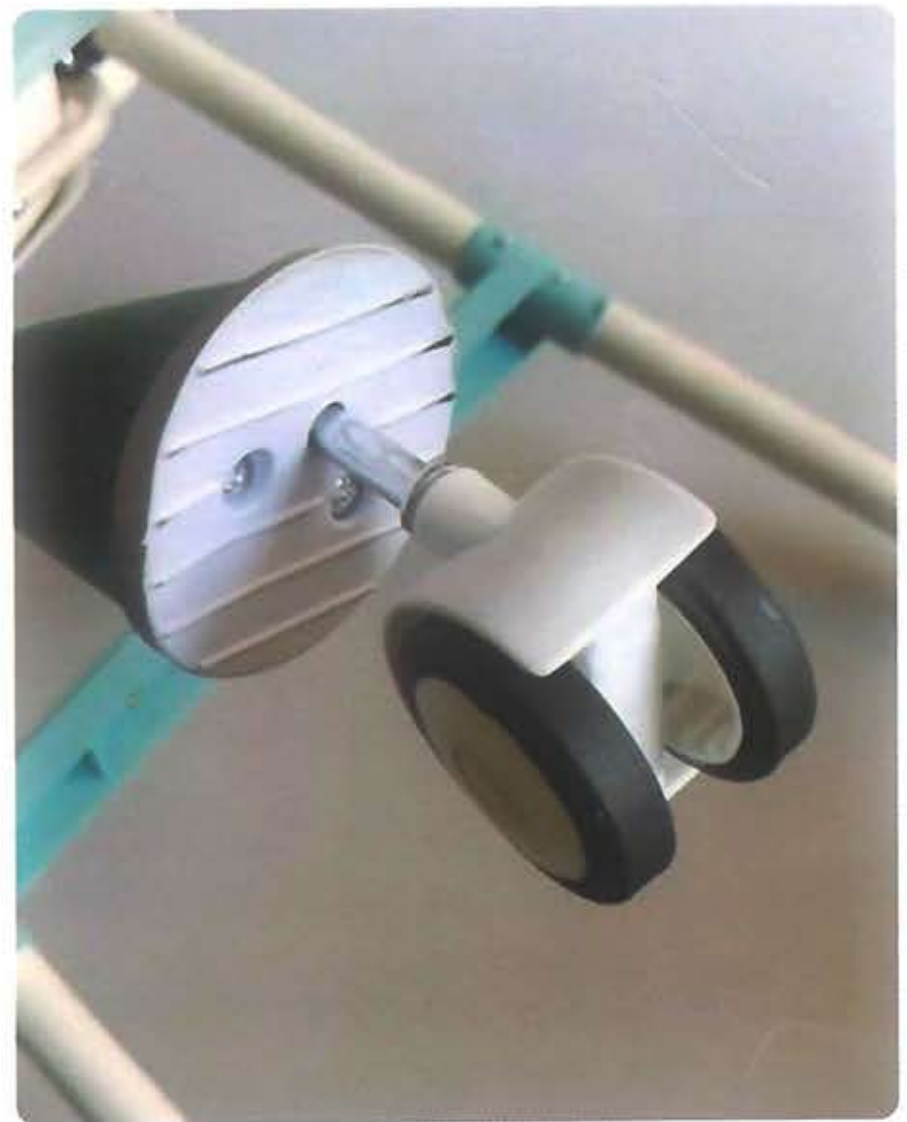
⑧ Install the universal wheel and the installation is completed