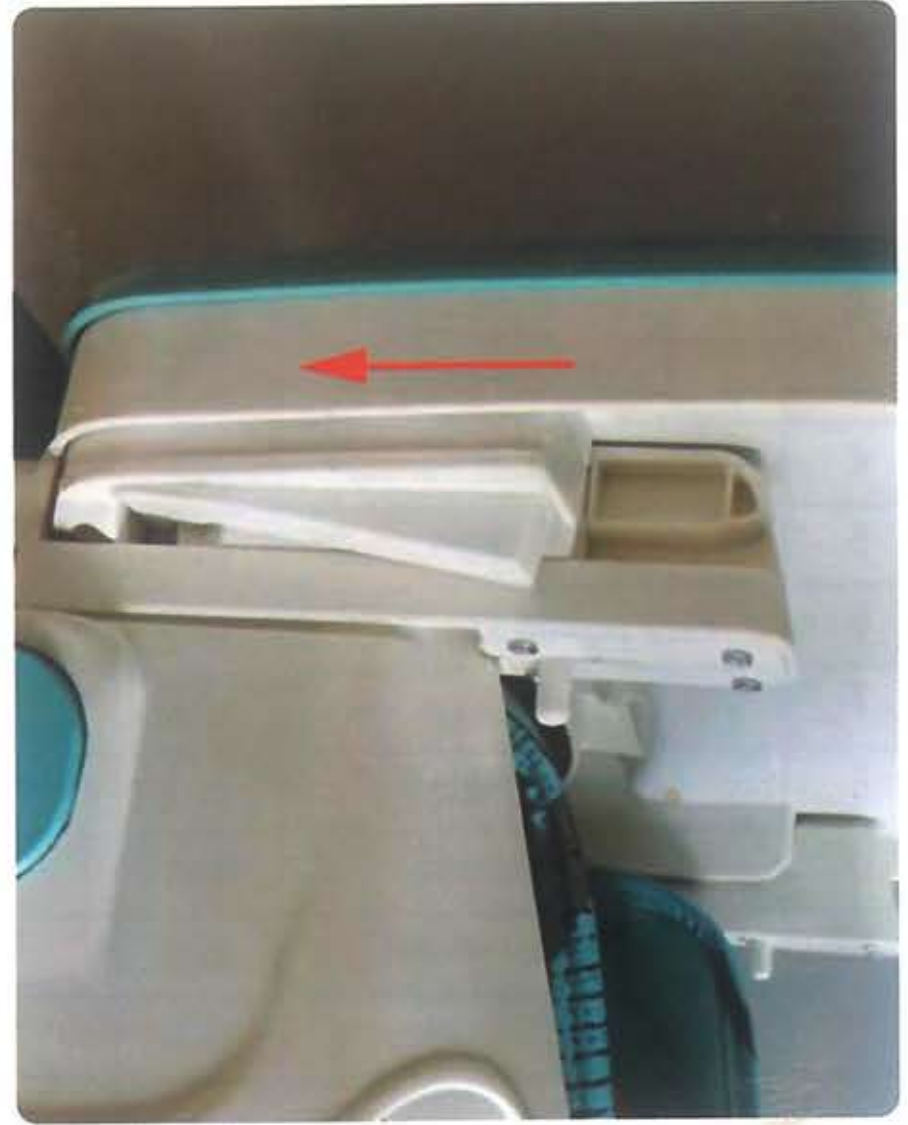
④ Press the button and push the plate inward