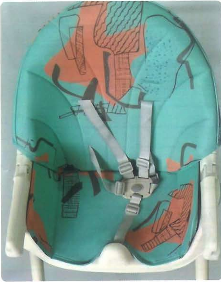
③ Install the seat cushion